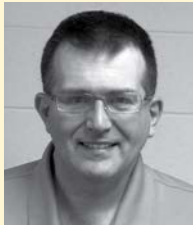
Road to a New Life Starts Here

We can meet the challenge of caring for our community's hurting because of you and your faithful support. Thank you for giving to bring new hope to countless lives forever.